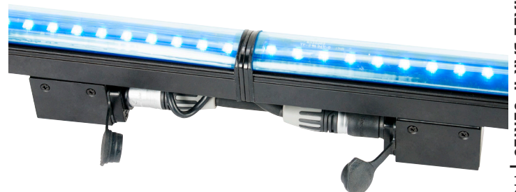
Magnetic End Caps - Seamless End-to-End Spacing

(Available in 2, 3, 5, 10, 12, 15, 20, 30, 50, meter lengths)